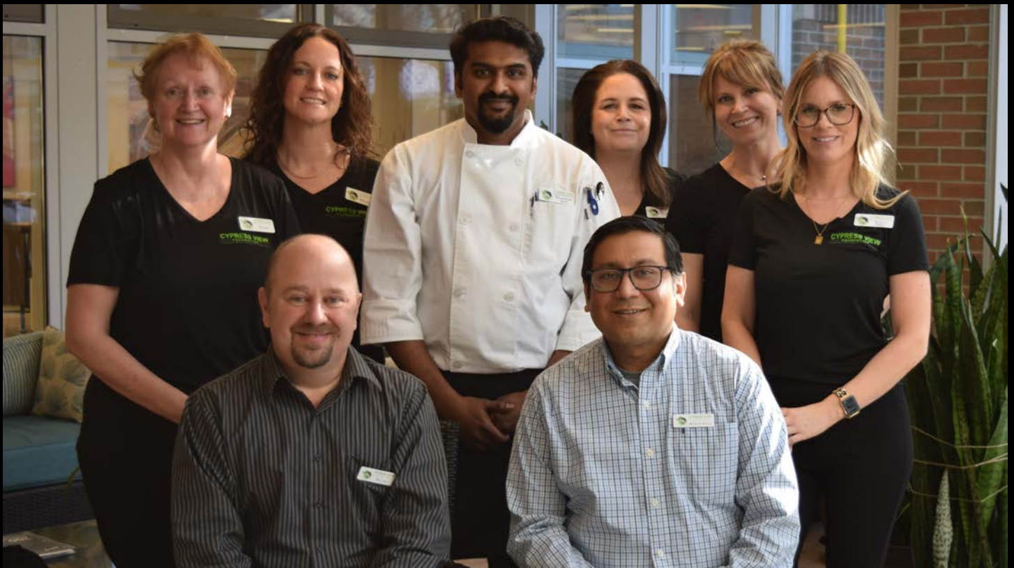
2024 Management Team